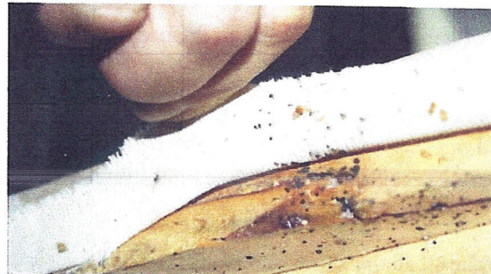
Bed bug spots under fabric stapled to the framing of box springs.