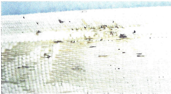
Typical bed bug spots and smears on a mattress.

nonchemical methods. By doing these things and working together with a pest control company, you'll help make the insecticides they use more effective.